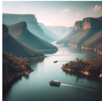
Blyde River Canyon Cruise