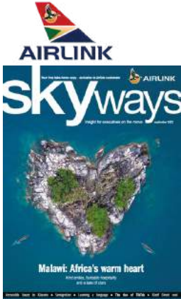
Sky Ways Airlink onboard magazine September 2023

Dutch couple Elly and Patrick Suverein fell in love with the bush and wildlife of South Africa 30 years ago. It was their first visit to the country and it ignited a lifelong passion for the region within them. In 2016, Elly and Patrick purchased their own plot of land there, with the intention of building a private home for themselves. It was a decision that led the pair to become leaders in the accessible travel space.