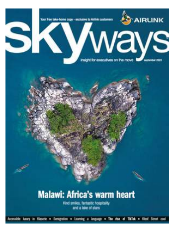
Sky Ways Airlink onboard magazine September 2023