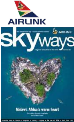
Sky Ways Airlink onboard magazine September 2023

Dutch couple Elly and Patrick Suverein fell in love with the bush and wildlife of South Africa 30 years ago. It was their first visit to the country and it ignited a lifelong passion for the region within them. In 2016, Elly and Patrick purchased their own plot of land there, with the intention of building a private home for themselves. It was a decision that led the pair to become leaders in the accessible travel space.