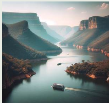
Blyde River Canyon Cruise

***For safety reasons not for guests with a mobility impairment